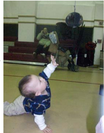
A future NYO athlete!

In December the Youth participated in a BrainWise class which taught them that everybody has problems and how to deal with them without blowing up. While they rode the Emotion Elevator they learned to use their Wizard Brain instead of their Lizard Brain, self talk and control was the name of the game!